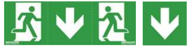
Supplied with universal sticker kit

DESCRIPTION: Surface mounted double-sided LED emergency exit sign Light distribution type: omnidirectional Optical system: clear PMMA diffuser Housing: polycarbonate Colour: white; light grey; black Battery charging time: 24 hours (12 hours optional: AUT) Battery: NiCd (LiFePO4 optional: AUT), deep discharge protection Recognition distance: 25 meters